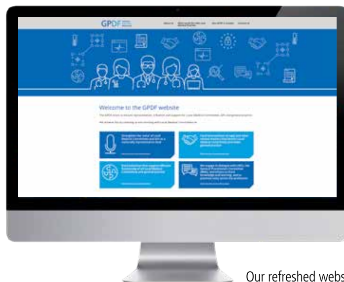
Our refreshed website